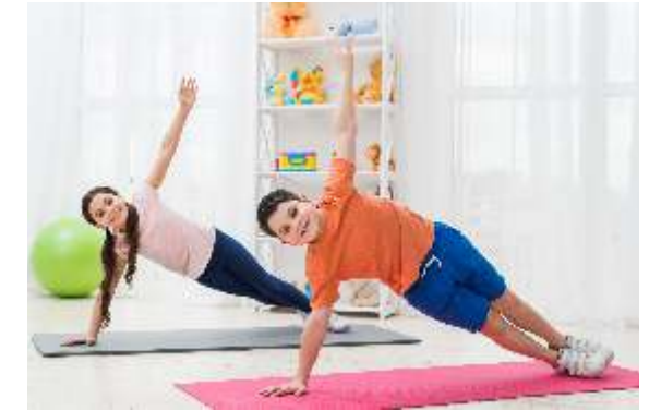
Yoga & Aerobics hall