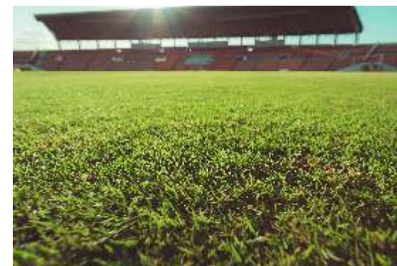
Multi Purpose Ground