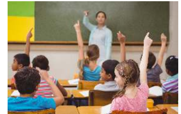
Well Equipped Classrooms