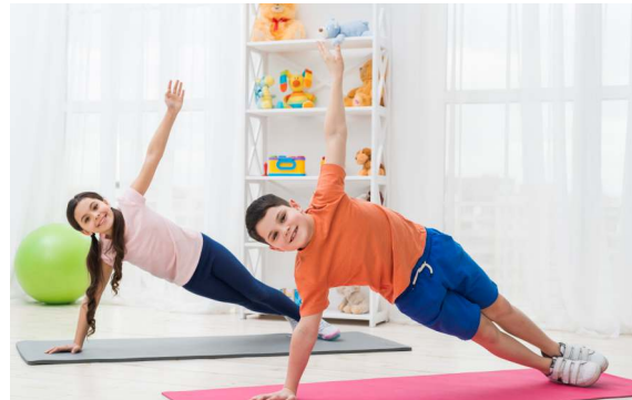
Yoga & Aerobics hall