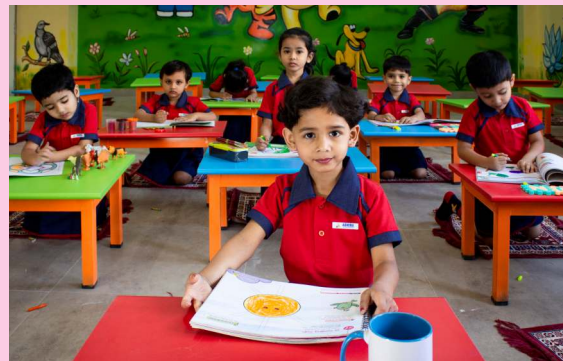
Activity based learning