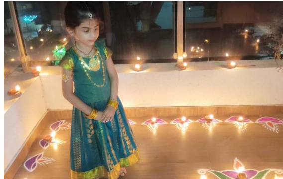
Diwali Decoration Contest