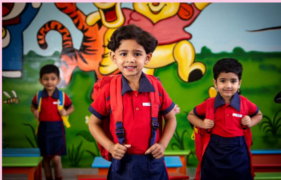
No more burden of heavy school bag