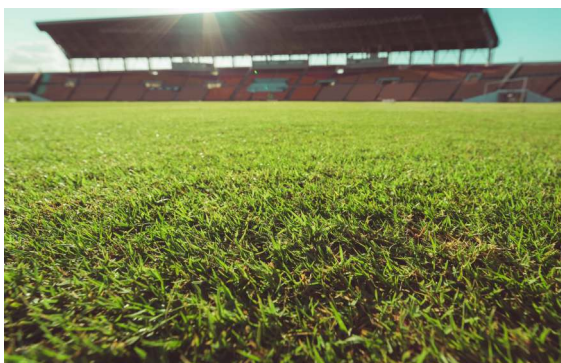
Multi Purpose Ground