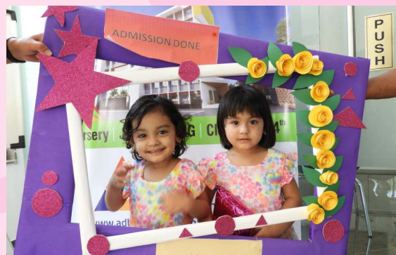
Education from Nursery to 12 th std