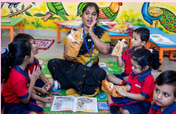
Interactive teaching methods