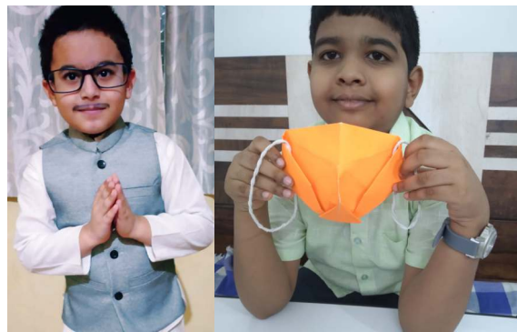
Fashion Fiesta & Craft Day