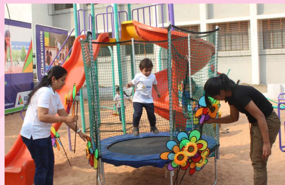
Safety and security topmost priority