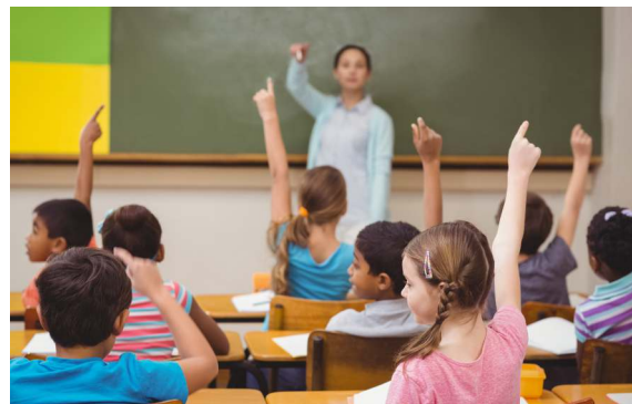
Well Equipped Classrooms