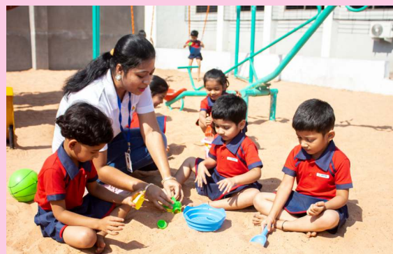
Physical development activity