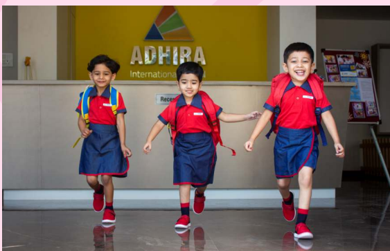
Happy child education system